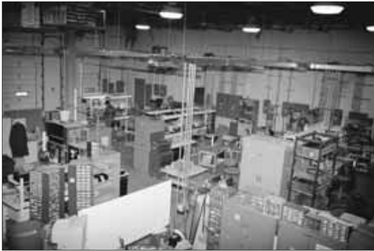
Roman installed a new 2000 amp customized electrical system with specialized multi-voltage testing equipment for Magnetek's renovated R&D plant.