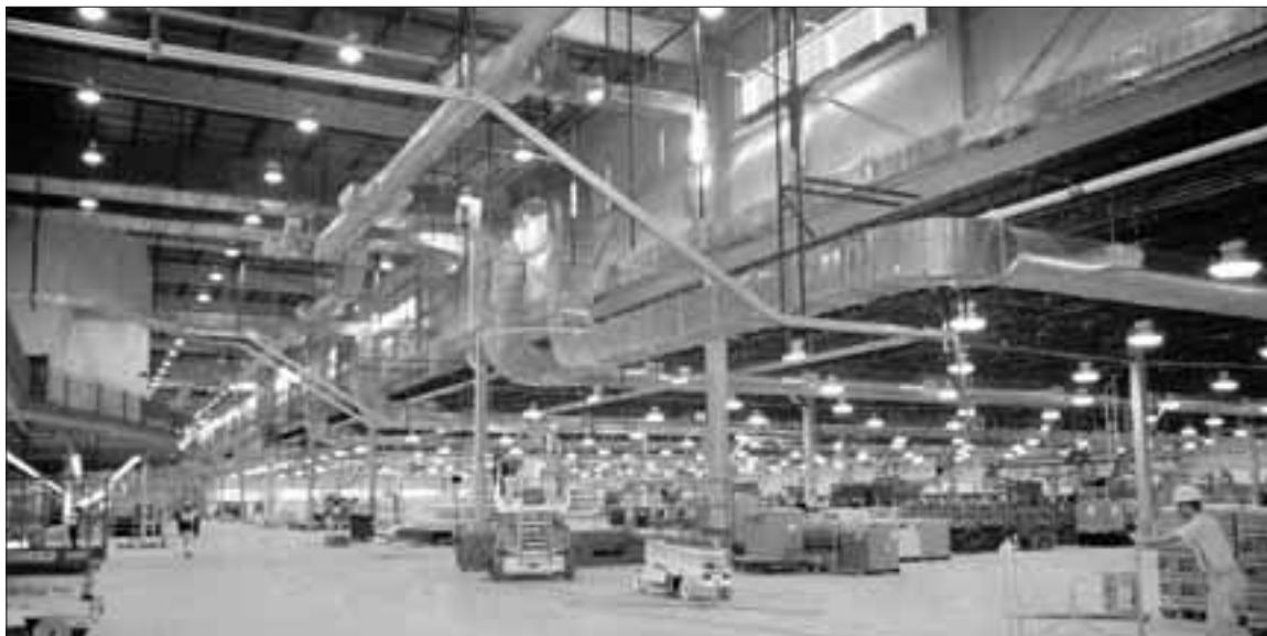
The well-lighted new Journal Sentinel newspaper production plant is illuminated by 4,650 fluorescent and HID lamps installed by Roman Electric crews.

Racine/Kenosha Office 2900 Wisconsin Street Sturtevant, WI 53177-2449 (262) 886-3742